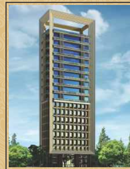
MITTAL GARDENIA Matunga, Mumbai