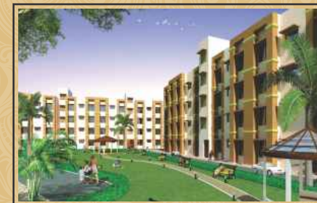
MITTAL EMERALD (Township) Karjat, Maharashtra