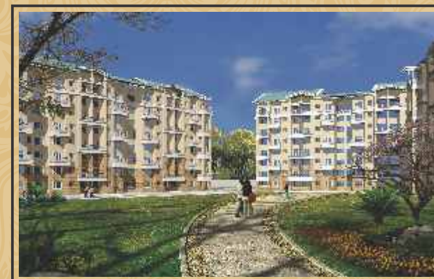
MITTAL ENCLAVE (Township) Naigaon (E), Vasai, Maharashtra