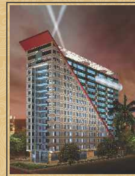
MITTAL COMMERCIALIA Andheri (E), Mumbai